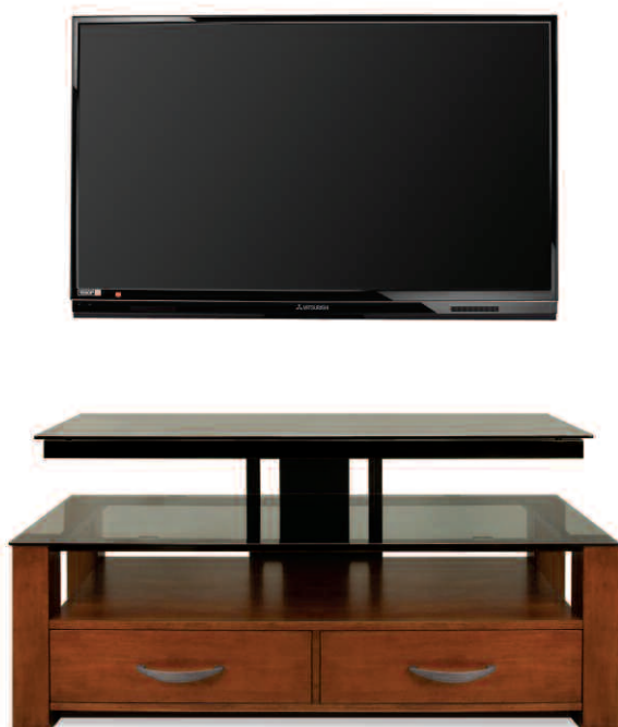
TV Shown Mounted on Wall Mount